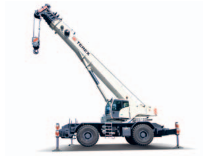
Terex® Quadstar 1075L

The underlying idea was centered on the keywords ergonomics, function, and mobility. But in designing the exterior and interior of the cabin of a construction machine, Porsche Engineering was entering new territory. The engineers were confronted with the challenge of translating their expertise in the automotive field to the world of heavy equipment.